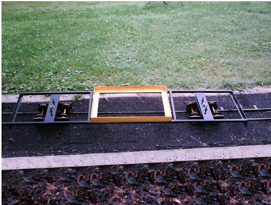
Wagon under construction picture by Steven Stuart.

This wagon is designed to build and repair track that is to far away from power points to run the necessary equipment. It will eventually form part of a work train with separate locomotive and crew wagon