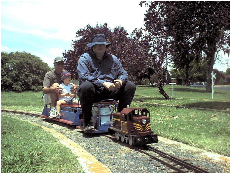
7002 on January running day

Locos in operation for the day were: steam locos 588 Lizzy with 2 carriages, and number 117 running light for trials, diesel loco 796 Fay with 2 carriages, and electric loco number 7002 with driving truck and 1 passenger car. All units performed very well during the running day with no breakdowns reported.